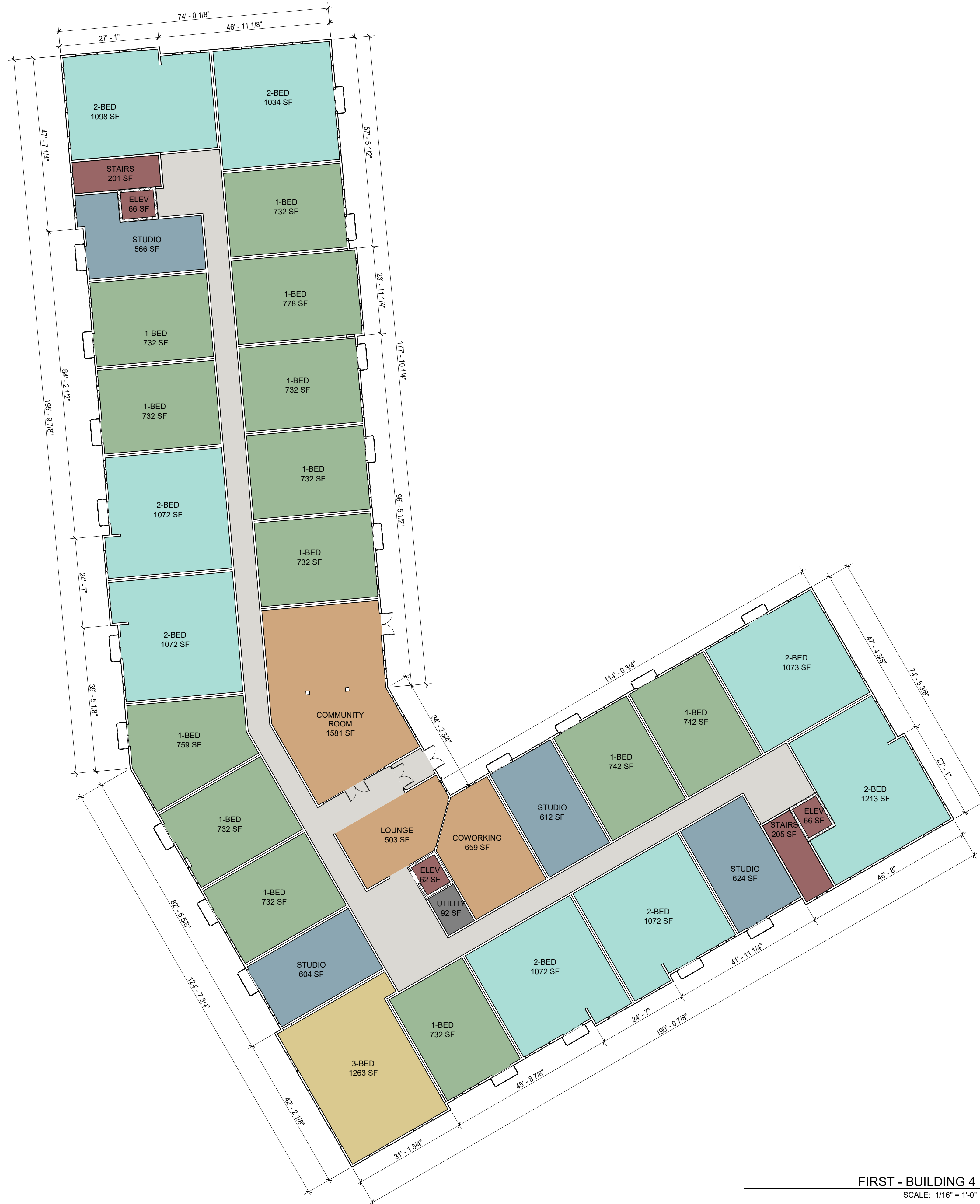
FIRST - BUILDING 4 SCALE: 1/16" = 1'-0" 1