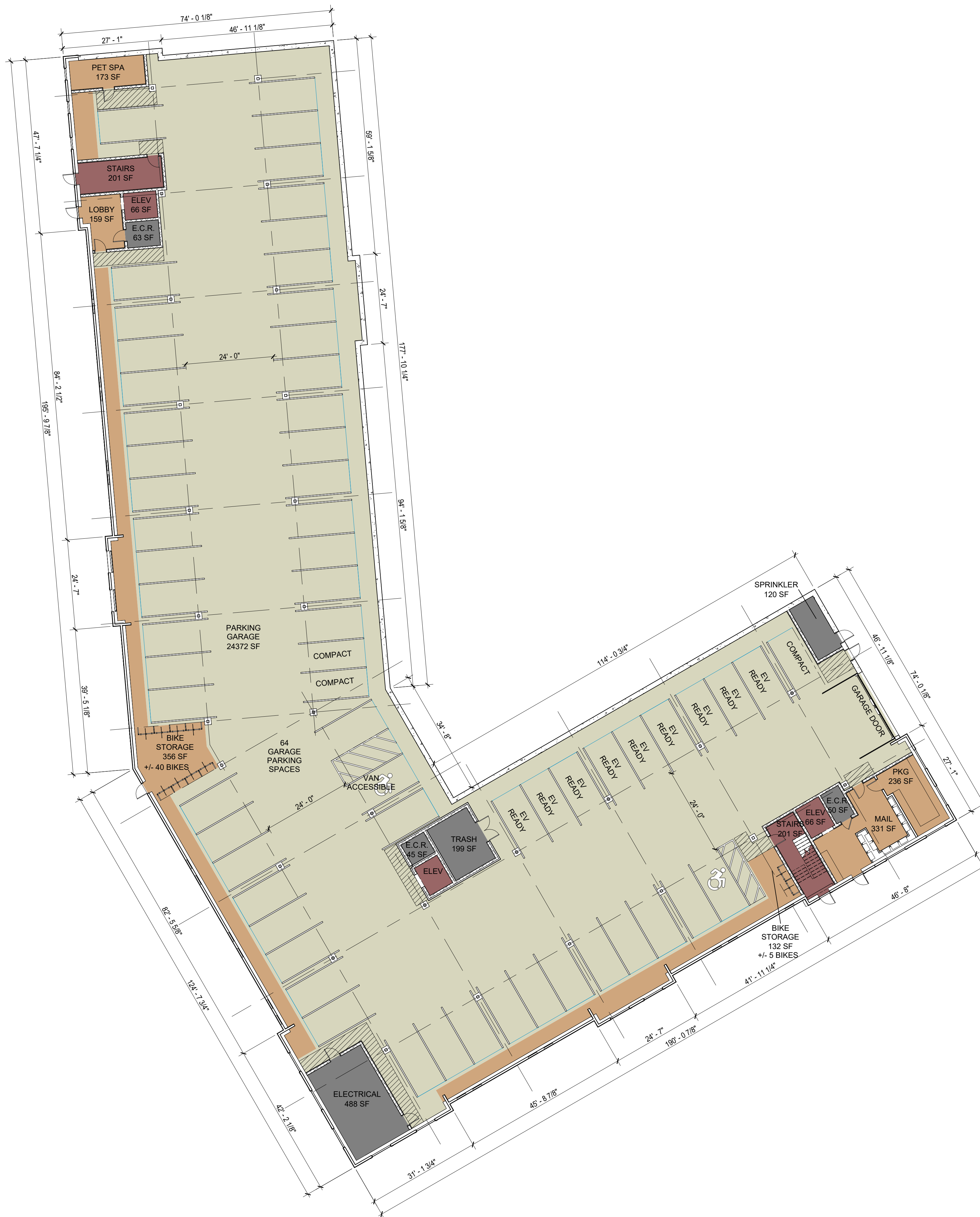
BASEMENT - BUILDING 4 (2) SCALE: 1/16" = 1'-0"